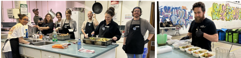
The Publicis Team preparing the dinners at Blythwood.

On Saturday, March 21st Publicis Canada prepared 144 BBQ chicken meals with roasted veggies, 8 vegetarian dinners, a variety of desserts and cheese squares. The meals were served at Blythwood's OOTC site, Church of the Holy Trinity. Our guests were also offered toiletries, clothing, backpacks, blankets and sleeping bags.